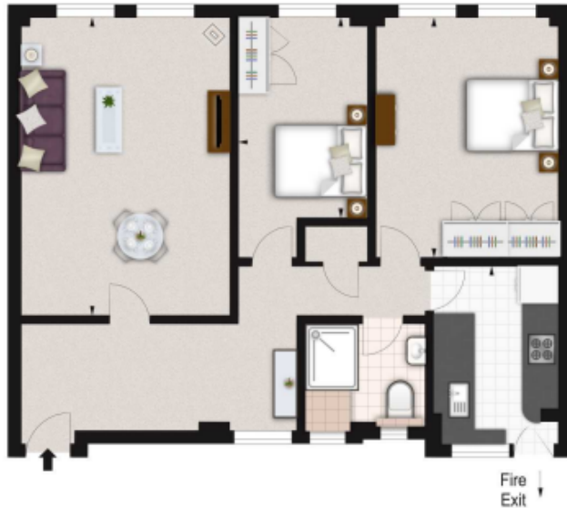
ILLUSTRATION FOR IDENTIFICATION PURPOSES ONLY. NOT TO SCALE * As Defined by RICS - Code of Measuring Practice

APPROX. GROSS INTERNAL AREA * 708 Ft 2 - 65.77 M 2